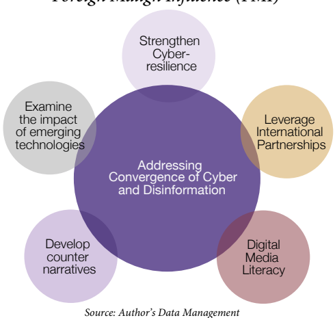
Figure 4 . Components of a Strategy to Address Cyber Convergence and Foreign Malign Influence (FMI)

Filipino officials and planners must recognize that the convergence of offensive cyber operations and disinformation activities is a new and menacing threat. As part of a gray zone playbook, this dangerous combination will ultimately be part of a foreign malign influence agenda aimed at weakening the Philippine position in the WPS. For this reason, the country's strategy to deal with this threat should veer away from its traditional fragmented and siloed approach. Instead, a proactive and long-term plan based on the concepts of cyber defense, psychological operations, and information warfare is needed. Figure 4 shows the possible components of this strategy, followed by a discussion on each section.